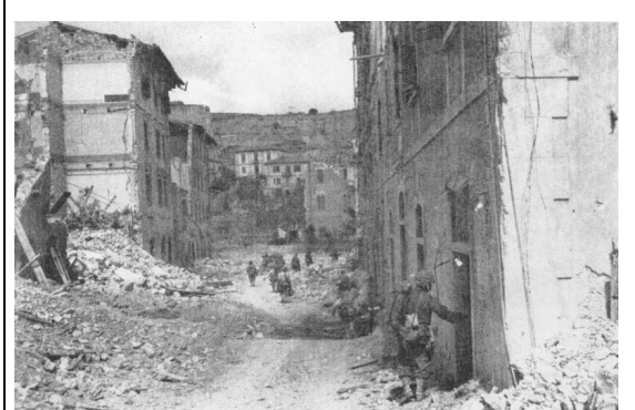
French troops enter Porto Ferraio